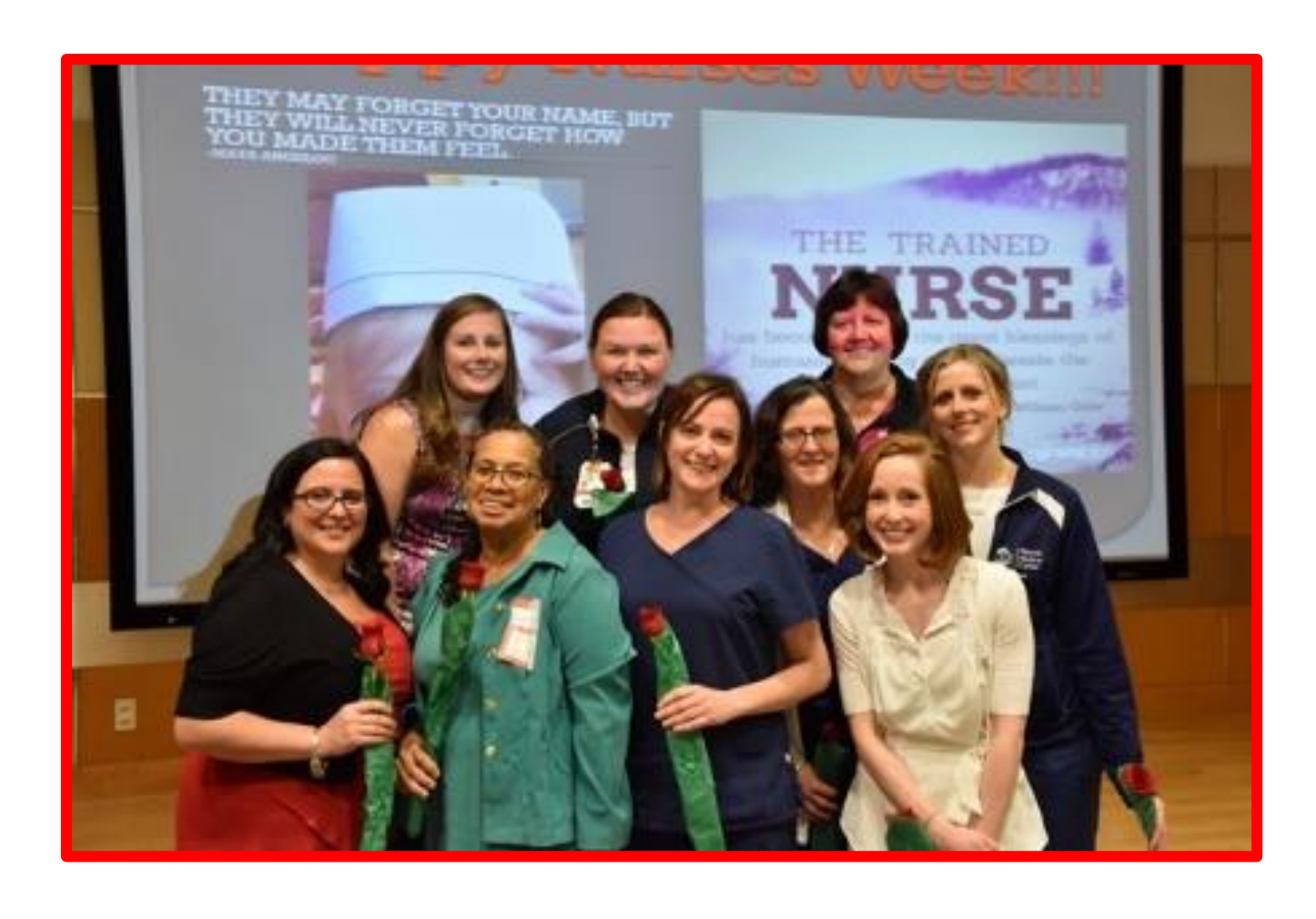
OSU Ross Nurses "The First 24 Hours After Open-Heart Surgery: A Nurse's Perspective"